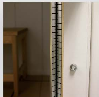
Knife Edge Door on TC4000