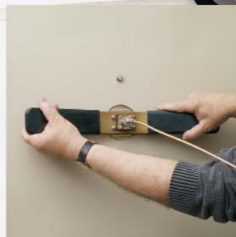
Antenna Rotation on TC4000