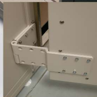
Rugged Door Hinge on TC4000